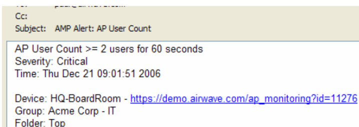
Figure 4 Email recipient of an alert

As seen in email from the recipient's perspective